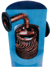
The tube coil inside the shell

See the flow diagram for the relevant heat exchanger type. As a general rule, the liquid at the lower flow rate should be routed through the coil. N.B. However, domestic hot water must always flow through the coil.